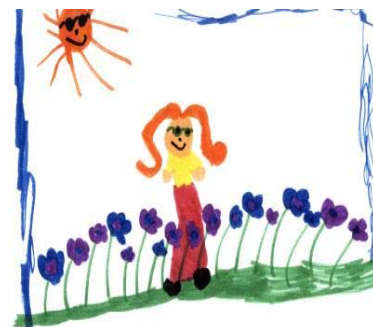
Mom in Park