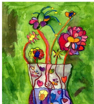
Flowers For Mom